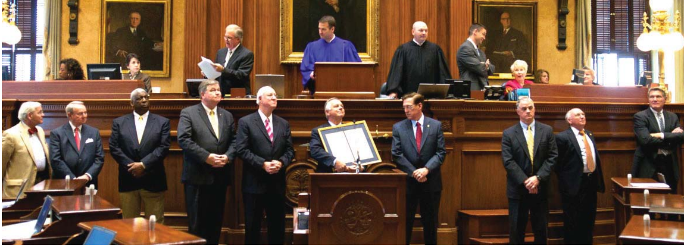
Lawmakers paused March 2 for the reading of a concurrent resolution saluting the SC Tree Farm Program and celebrating sixty-five years of Tree Farming in the Palmetto State.

South Carolina's Tree Farm Program proudly marks 65 years of service as it continues to assist landowners in making the most of their timberland via a network of dedicated volunteers.